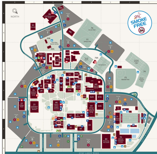
CHULA VISTA CAMPUS SCHOOLS & DEPARTMENTS MAP LOCATION SCHOOL/DEPARTMENT BLDG ROOM

900 Otay Lakes Road Chula Vista, CA 91910-7299 (619) 421-6700