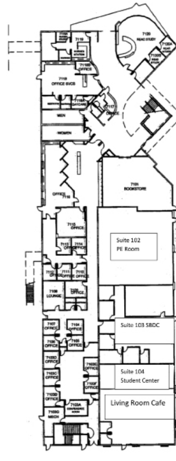
Legend - First Floor

880 National City, Blvd National City, CA 91950-1123 (619) 216-6665